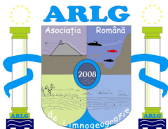
Romanian Limnogeographical Association