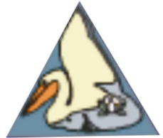
Danube Delta National Institute for Research and Development