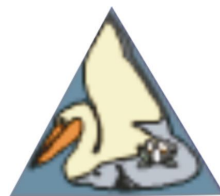
Danube Delta National Institute for Research and Development