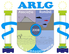
Romanian Limnogeographical Association